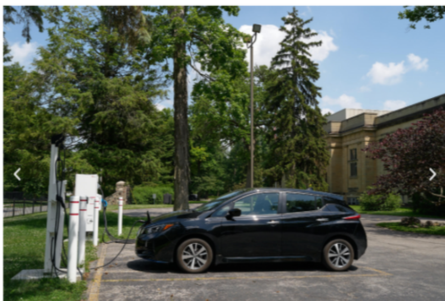
The Sisters' electric car charges at a free station installed for public use at the Rutherford B. Hayes Presidential Center in Fremont, Ohio.